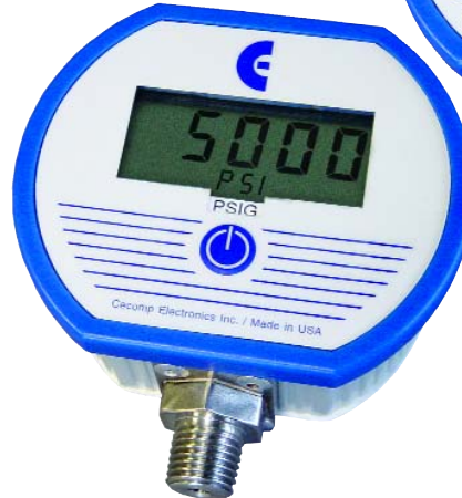
DPG1000B5000PSIG-5 0 to 5000 psig range