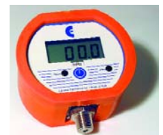
RB Rubber Boot Not for NEMA 4X models

Compensated Temperature 32 to 158°F (0 to 70°C)