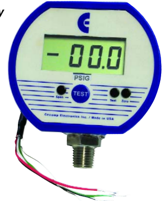
DPG1000DR5000PSI-V 5000 psig Range 0-2 V Output