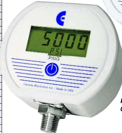
F4B5000PSIG-5 0 to 5000 psig range