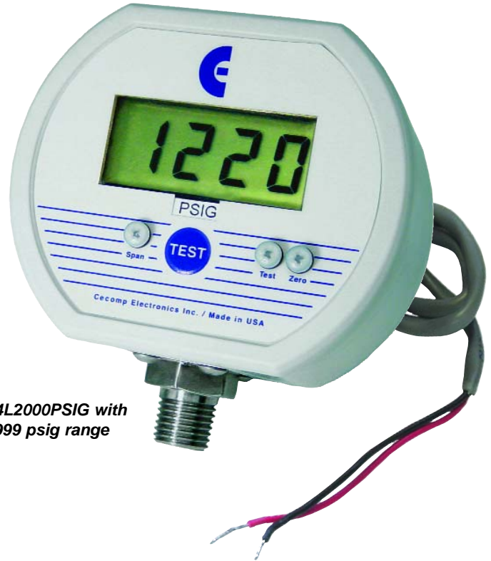
F4L2000PSIG with 1999 psig range