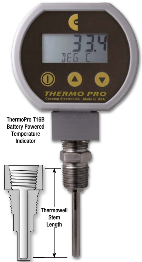
ThermoPro T16B Battery Powered Temperature Indicator

See thermowell manufacturer's specifications. Note that stem length is NOT the same as thermowell insertion depth.