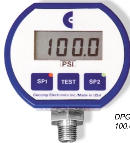
DPG1000DAR with 100.0 psig range

Digital Pressure Gauge Dual Alarms & Retransmitting Output Low Voltage AC or DC Powered